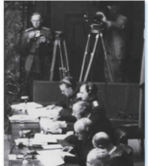
U.S. Signal Corps camera teams were able to shoot only 25 hours during the 10-month trial, a major challenge for the filmmakers later charged with making Nuremberg: Its Lesson for Today.

The screening of Nuremberg is co-sponsored by MCHE and the Harry S. Truman Library and Museum. A dessert reception will follow the film.