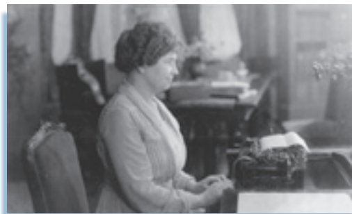
Helen Keller's work, Wie ich Sozialisten wurde (How I Became a Socialist) was banned by the Nazi regime.

From April 20 through June 17, the Wyandotte County Historical Museum, 631 North 126th, Bonner Springs, Kansas, will host the United States Holocaust Memorial Museum's traveling exhibition Fighting the Fires of Hate: America and the Nazi Book Burnings . Using documents, film, video and newsreel footage, the exhibition provides a vivid look at the first steps the Nazis took to suppress freedom of expression and the strong response that occurred in the United States